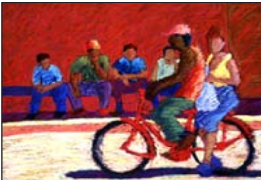
TWO PASTELS: El Moreno y Huera, Dos Beans

I attempt to depict not objective reality, but rather the subjective emotions and responses that objects and events arouse in me.