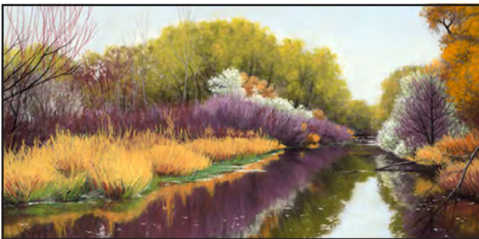
TWO PASTELS: Colorful Creek, Winter Light