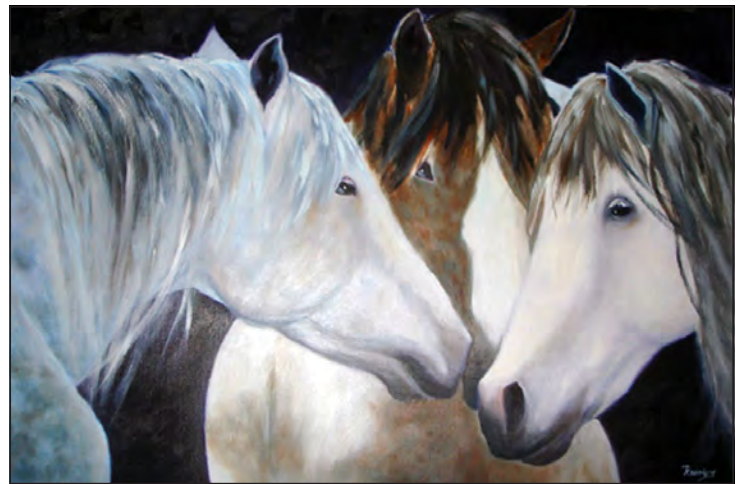
ABOVE: Girl Talk BELOW: North Wind RIGHT: Side By Side