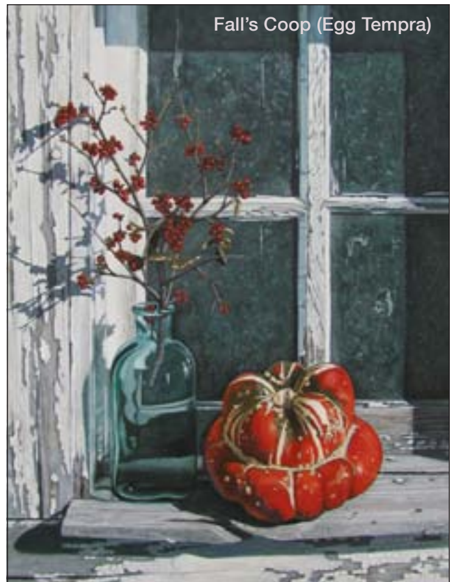
Fall's Coop (Egg Tempra)