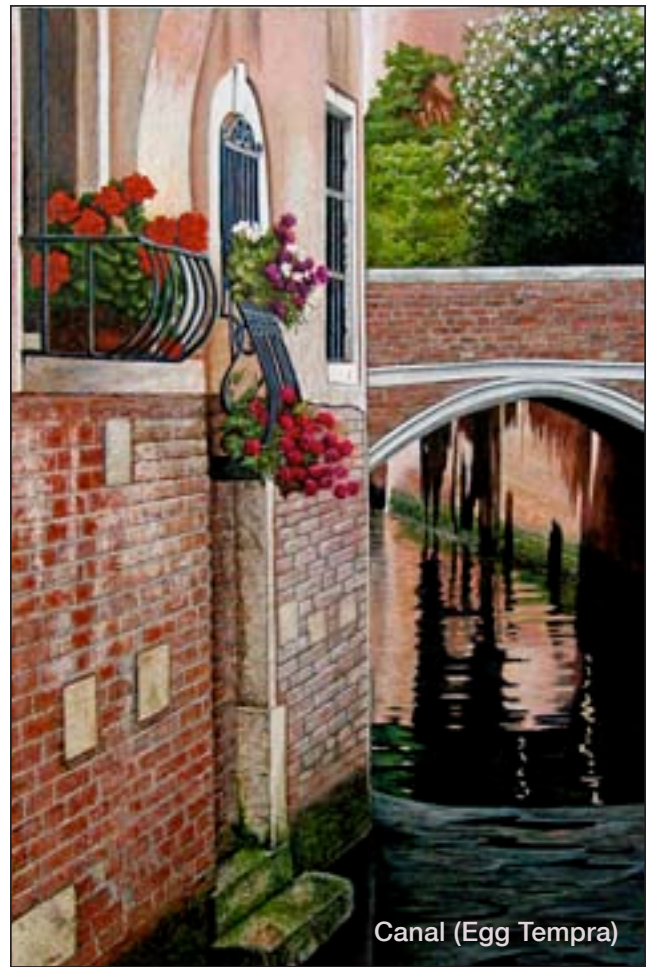
Canal (Egg Tempra)