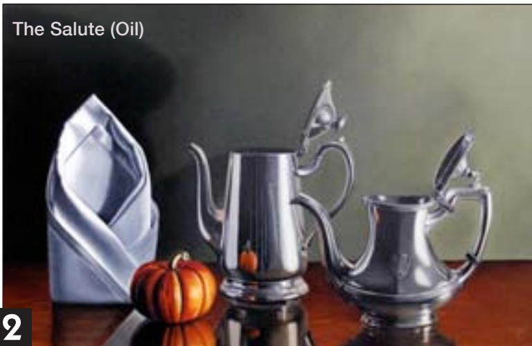
The Salute (Oil)